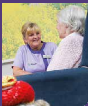
Home Interior Images of Abbey Wood Lodge