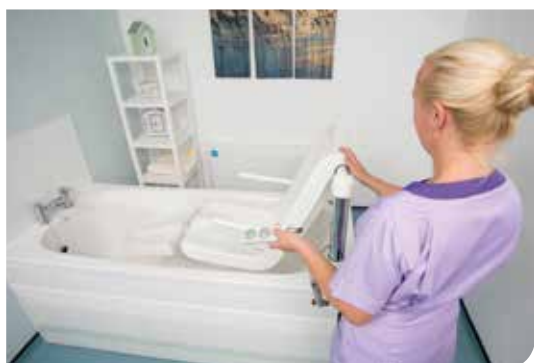
Home interior images of Abbey Wood Lodge and Parklands Lodge