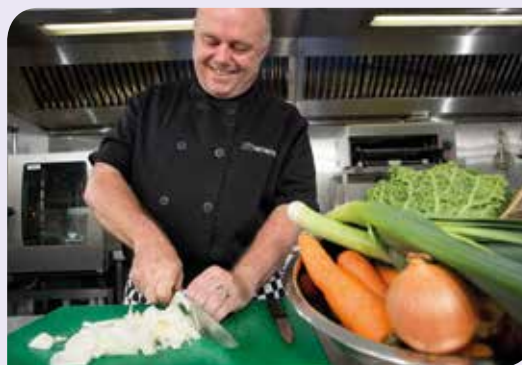
Image of Parklands Lodge

Our upper two floors are designed for people with higher levels of dependency and the members of staff have the specialist skills to meet these needs. This includes residents who are living with dementia as a result of conditions such as Alzheimer's or Parkinson's disease.